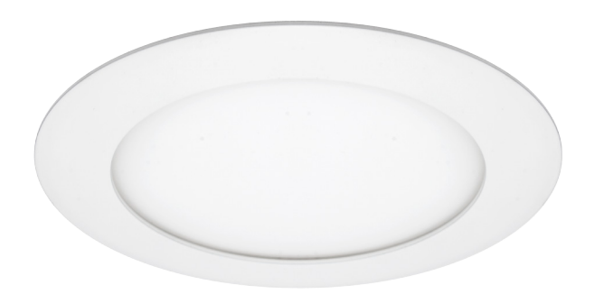
6" Brio Disc - Round BR6-30-RD (12W / 3000K / 925Lm) BR6H-30-RD (15W / 3000K / 1100Lm)