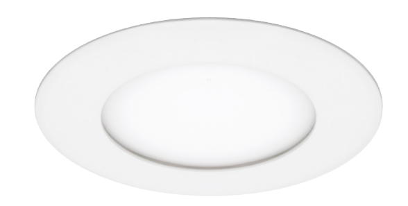
4" Brio Disc - Round BR4-30-RD (9W / 3000K / 525Lm)