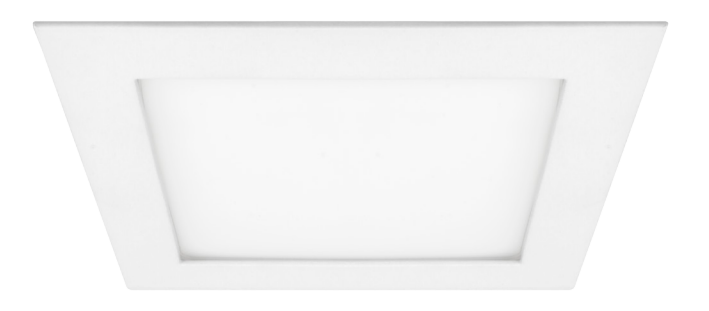
6" Brio Disc - Square BR6-30-SQ (12W / 3000K / 900Lm)