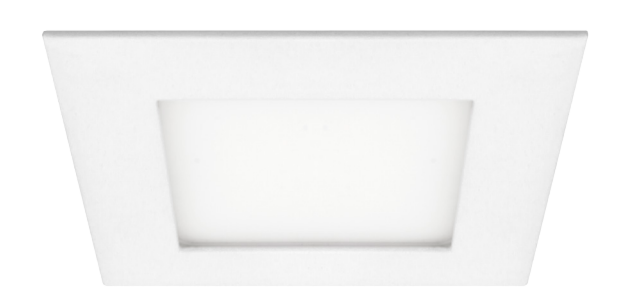
4" Brio Disc - Square BR4-30-SQ (9W / 3000K / 500Lm)